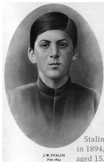
Stalin in 1894, aged 15.

Soso/Iosef was kicked out of the seminary for espousing Marxism, then became the disgruntled, but organised thief Koba, who specialised in robbing Jewish jewellery stores and banks – those that were in opposition to the Rothschilds. After a particularly violent robbery in which Iosef/Koba clubbed people to death with a pistol butt, Lenin named him 'Stalin' – "Man of Steel".