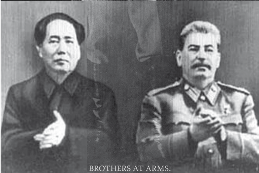
BROTHERS AT ARMS.

It was much the same thing. Stalin and Hitler were both National Socialists who filled the void of toppled monarchies. Still, I wouldn't have minded being in the meeting rooms when these plans were being discussed.