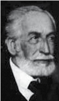
Stalin's father: Baron Edmond de Rothschild.