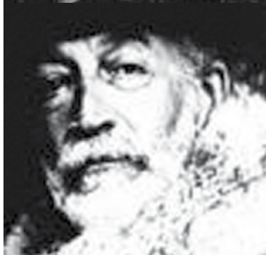
Baron Edmond de Rothschild.