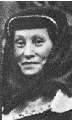
Stalin's mother: Ekaterina Georgievna Geladze-Djugashvili.

Russia's agreement to the formation of the United Nations at the end of WWII was that a NKVD/KGB agent would always be 2IC. They had the bargaining power as they were considered the mightiest army in the world. If Germany won, an SS agent would always be 2IC of the United Nations.