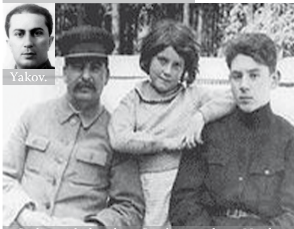
Stalin with daughter Svetlana and son Vasily.

It would appear that Stalin named his first son 'Yakov' (James), after his supposed father and wealthy Jewish wine merchant Prince Yakov Egnatashvili, after his real father Baron Edmond James (Yakov) de Rothschild, and after his real grandfather Baron James (Yakov) Mayer Rothschild.