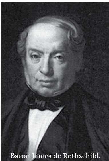
Baron James de Rothschild.